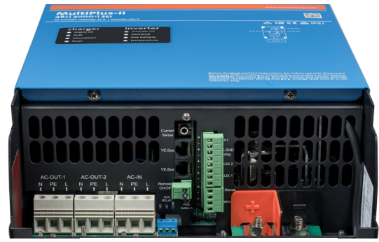
Connection Area MultiPlus-II 3k